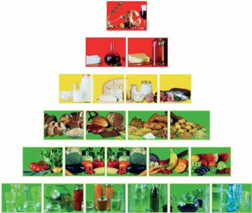
The nutrition pyramid

Children have a sweet tooth and love to drink lemonade and eat white bread. But not eating a balanced diet and getting enough exercise means that a vast number of children today suffer from obesity, which in many cases will continue into adulthood. That in turn leads to health problems such as diabetes or premature wear and tear of the joints.